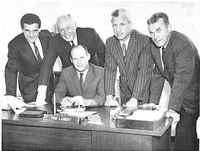
Dick Nolan • Red Hickey • Tom Landry • Jim Myers • Ermal Allen