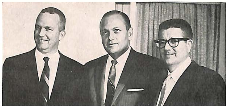
Bedford S. Wynne • Texas E. Schramm • Clint W. Murchison, Jr.